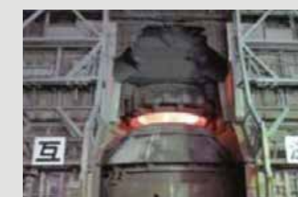
Basic Oxygen furnace