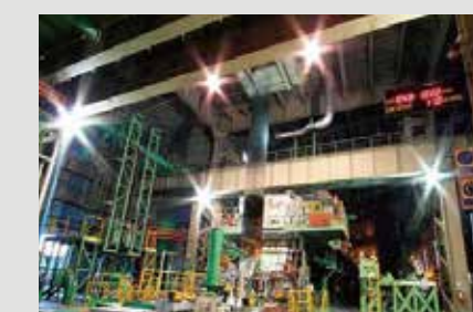
Continuous Hot-Dip Galvanizing Line (CGL)