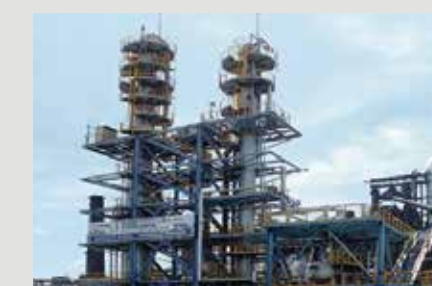
Energy-saving CO 2 Absorption Process (ESCAP)