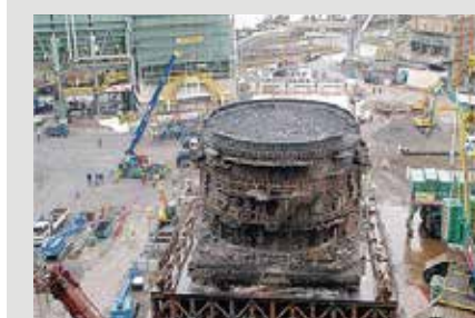
The removed furnace bottom block