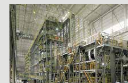
Continuous Anneling and Processing Line (C.A.P.L)