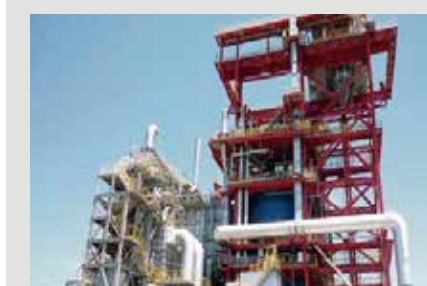
Coke Dry Quenching Facilities (CDQ)