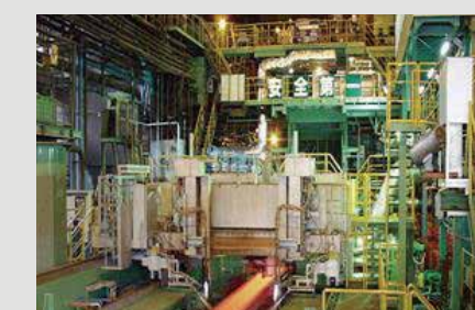
Continuous Casting Machine