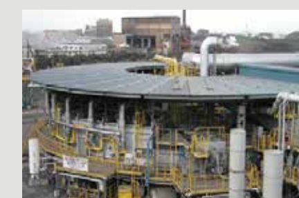
Rotary Hearth Furnace