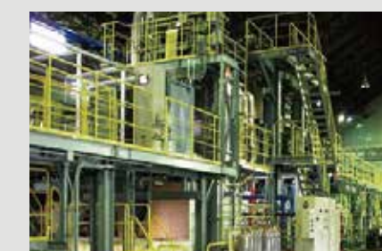
Nonferrous Metal Preprocessing Line