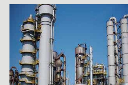
COG Desulfurization Equipment